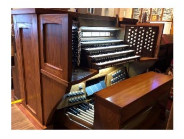
St. Cross Episcopal Church Hermosa Beach, CA New 4-Manual Draw-Knob Console